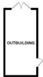
OUT BUILDING 1007 sq.ft. (93.5 sq.m.) approx.