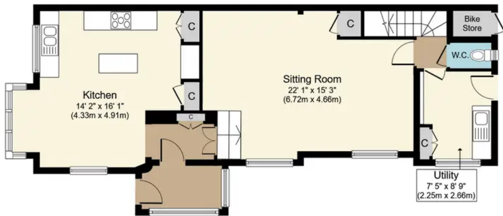
Ground Floor Approximate Floor Area 788 sq. ft. (73.2 sq. m.)