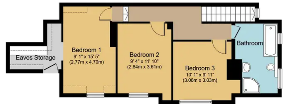
First Floor Approximate Floor Area 623 sq. ft. (57.9 sq. m.)