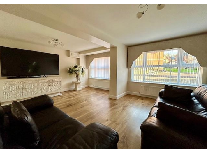
Second Reception Room: 16'1 x 11'8 (4.91m x 3.54m) Utilised by the current vendors as a games room. Cornice to ceiling, walk in bay window to the front elevation, feature

fire surround housing gas fire, wall light points and two radiators.