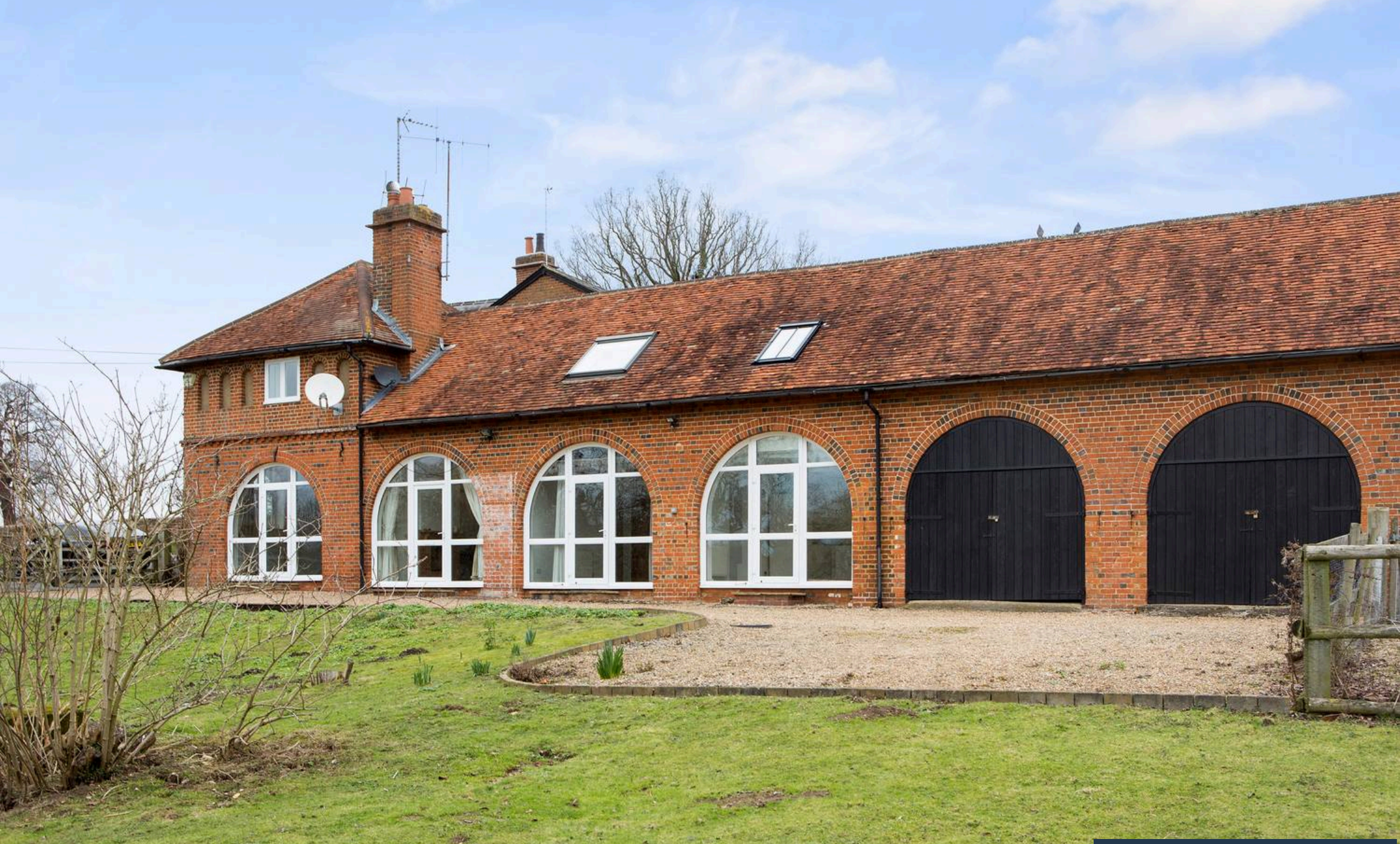
The Cottage, Guilehill Lane, Ockham £2,950 pcm