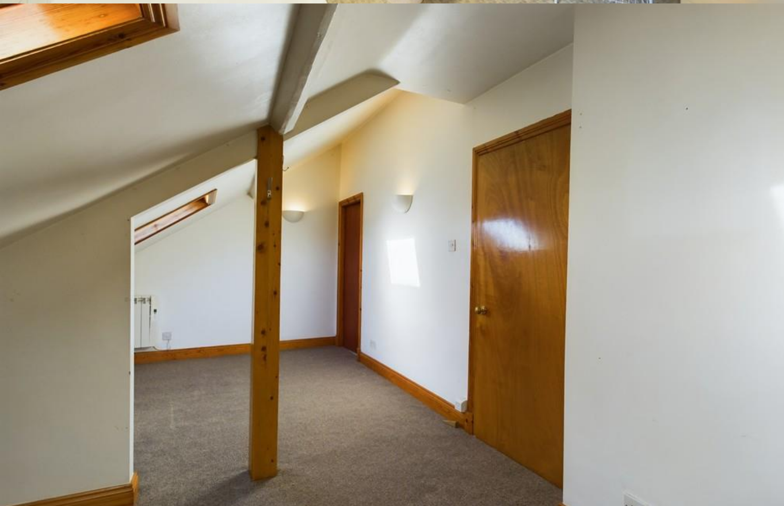
Open Plan Living