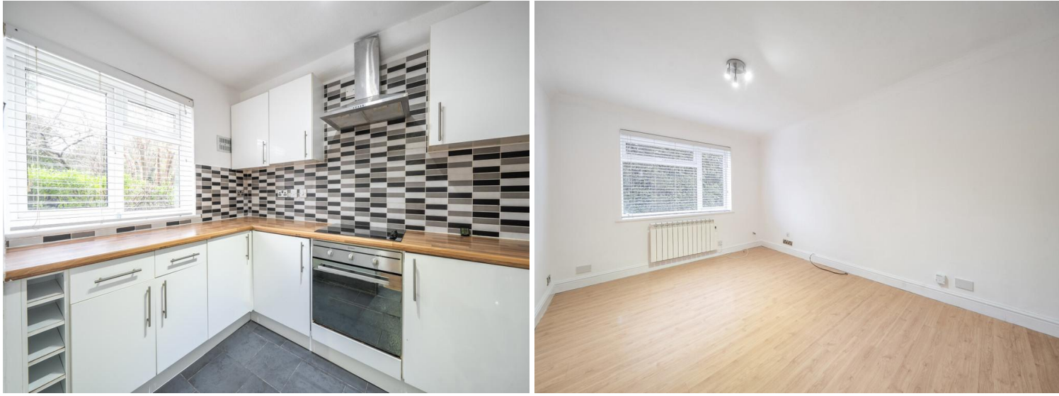
Flat 1, 5 Park Hill, Carshalton, SM5 3RS | Guide Price £220,000 Leasehold

This superb one-bedroom ground-floor flat is a fantastic opportunity for first-time buyers or investors. The property is presented in good condition throughout, featuring a bright and spacious double bedroom, a separate kitchen, and a welcoming living area. Offered with no onward chain, this flat promises a hassle-free move-in experience.