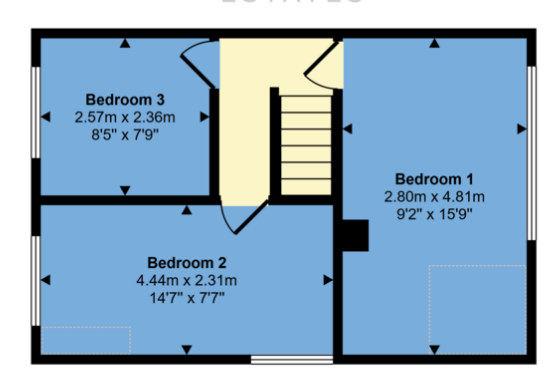
First Floor Approx 36 sq m / 383 sq ft