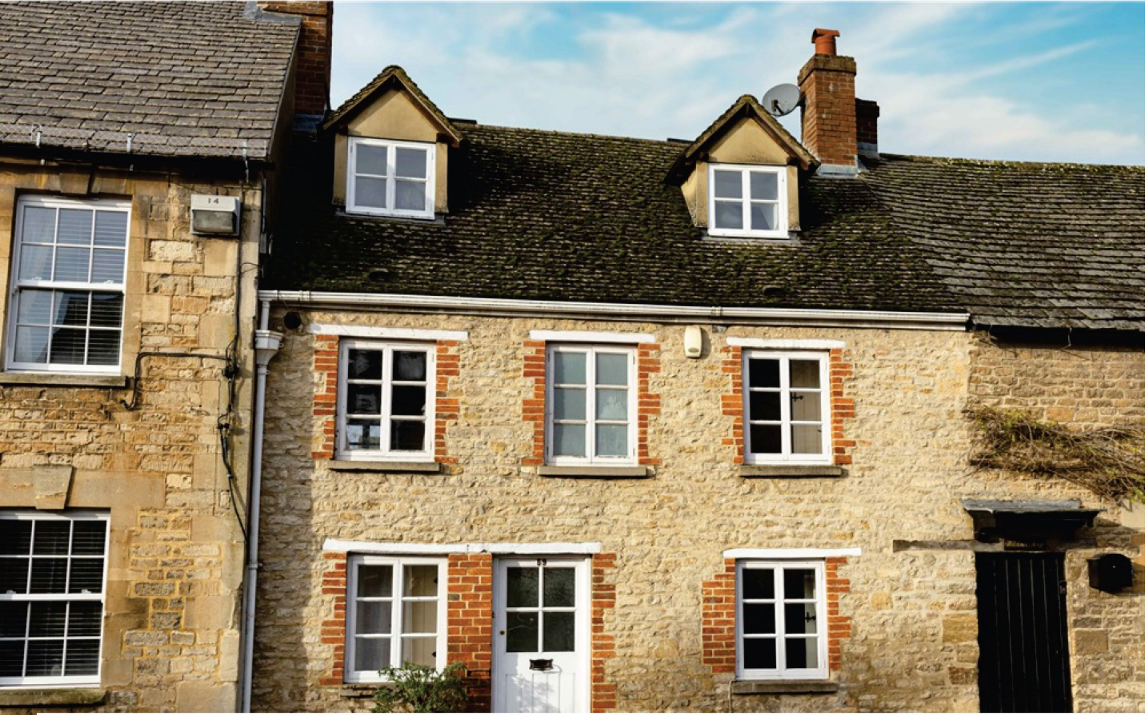
Mill Street, Eynsham