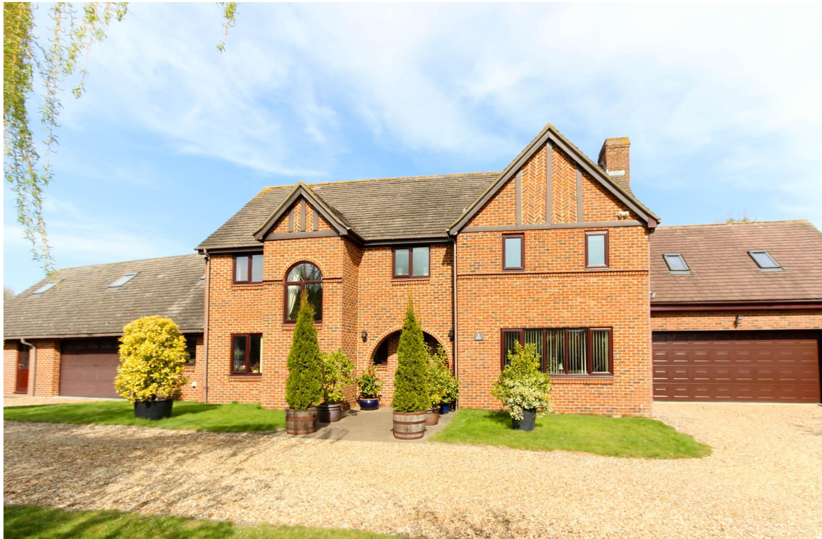
White Delves Wellingborough NN8 5XW Freehold