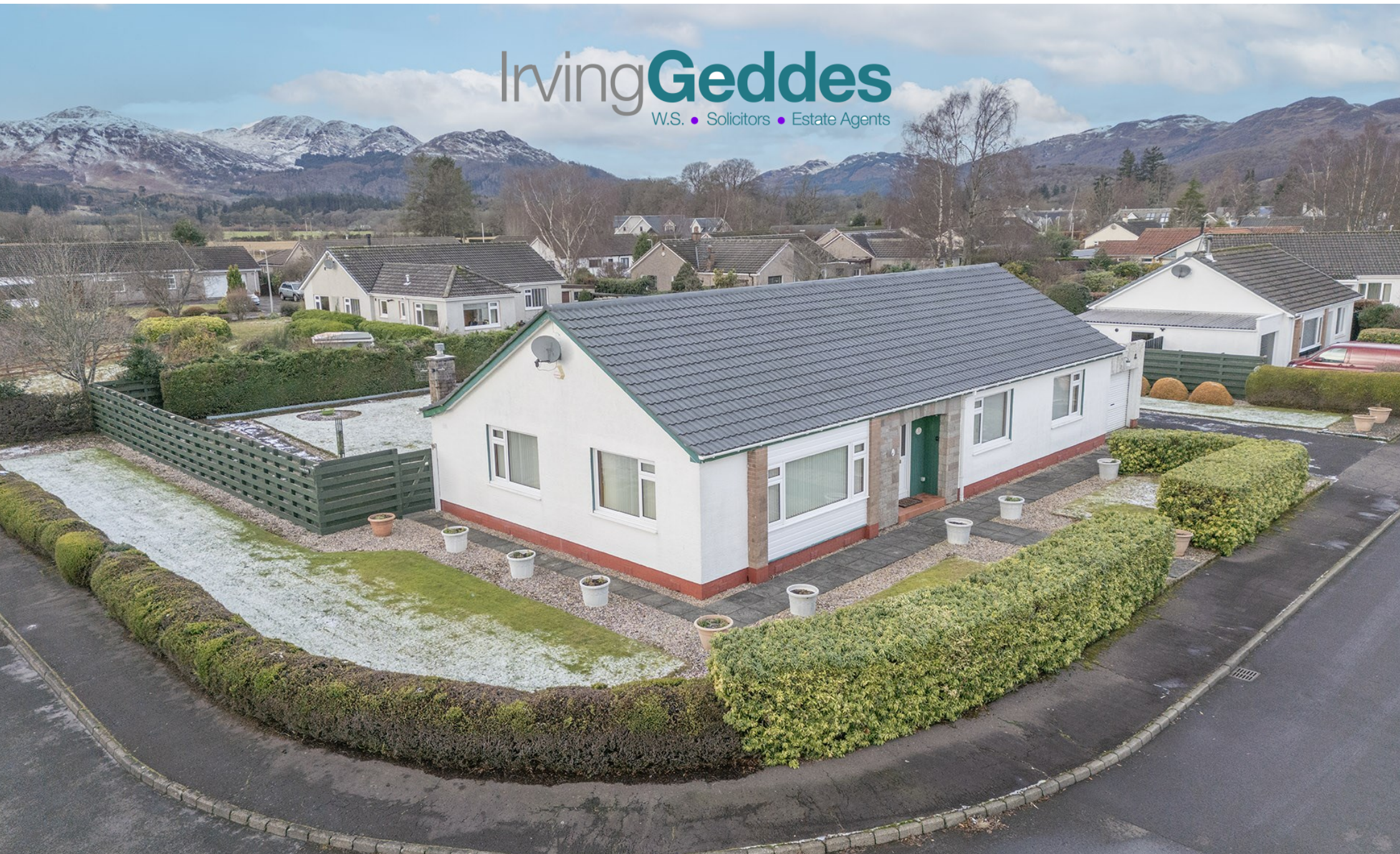
1 RUCHIL PLACE, COMRIE, PERTSHIRE, PH6 2HT