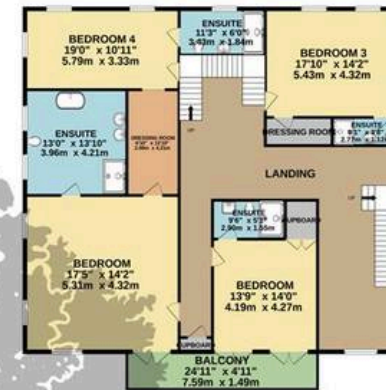
2ND FLOOR 2203 sq.ft. (204.7 sq.m.) approx.