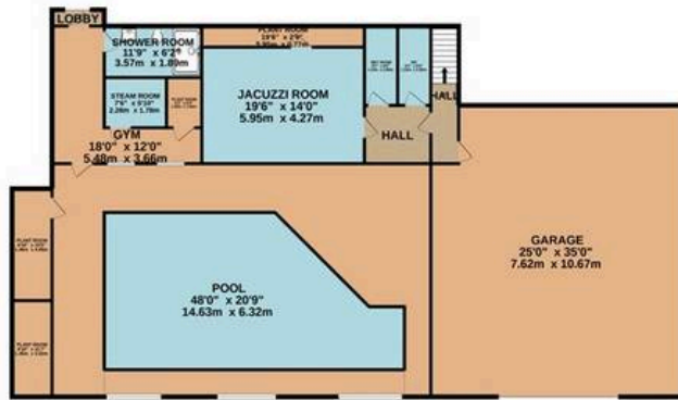
GROUND FLOOR 3255 sq.ft. (302.4 sq.m.) approx.