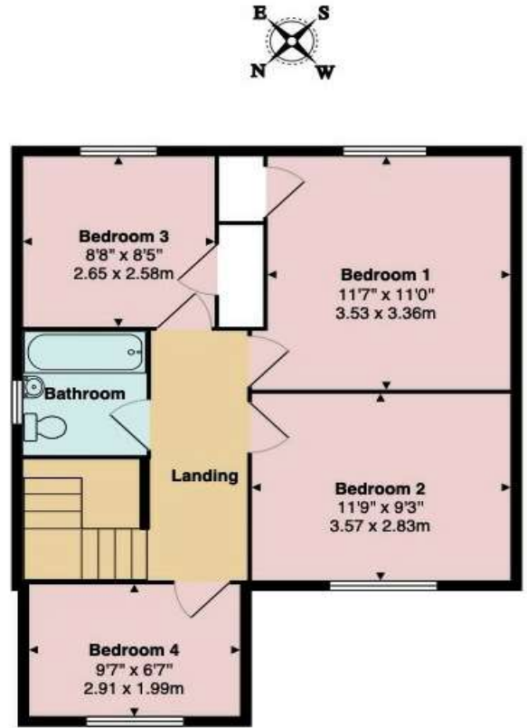
1st Floor Area: 529 ft 2 ... 49.2 m 2

Total Area: 1294 ft 2 ... 120.2 m 2 (excluding garage) All measurements are approximate and for display purposes only