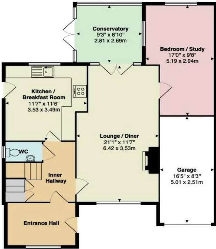
Ground Floor Area: 765 ft 2 ... 71.0 m 2