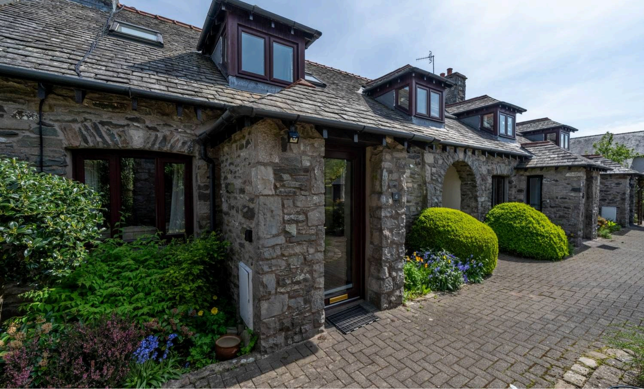
4 Town End Court, Natland £185,000