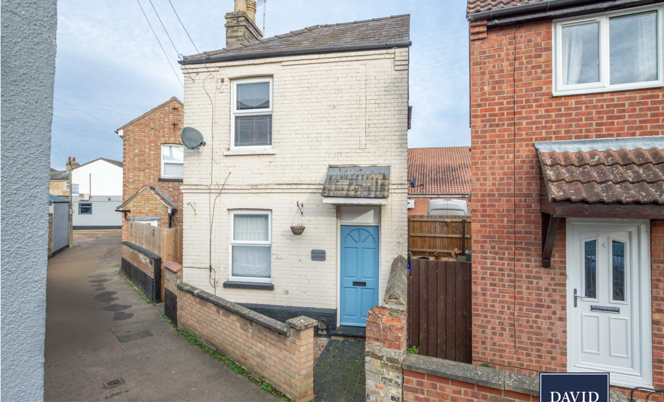
Top Flat, St Faiths Cottage Newmarket, Suffolk