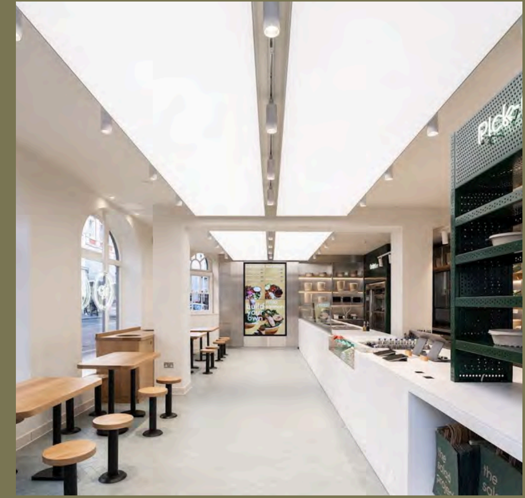
THE SALAD PROJECT