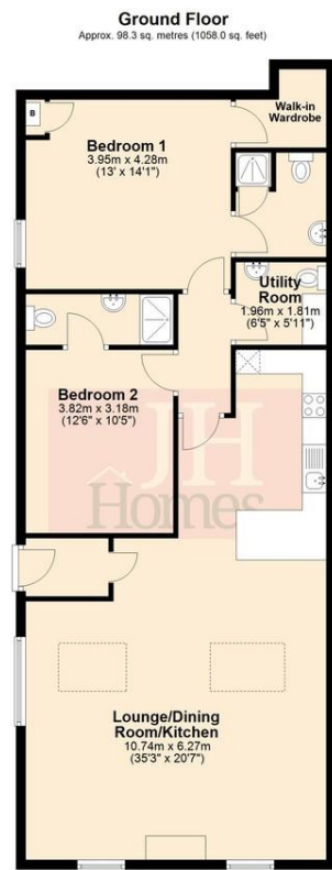
Total area: approx. 98.3 sq. metres (1058.0 sq. feet)