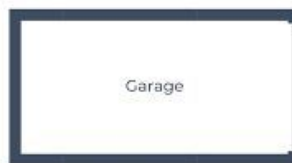
Garage (Not Shown In Actual Location / Orientation)