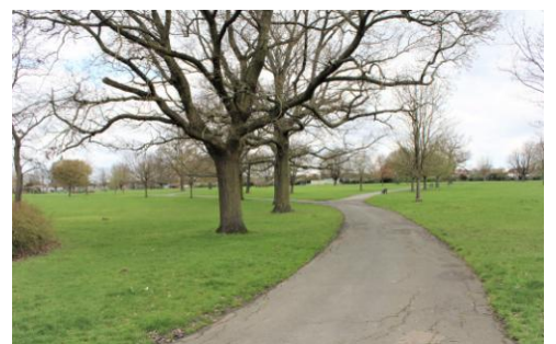
Longwood Gardens Clayhall, Essex, IG5