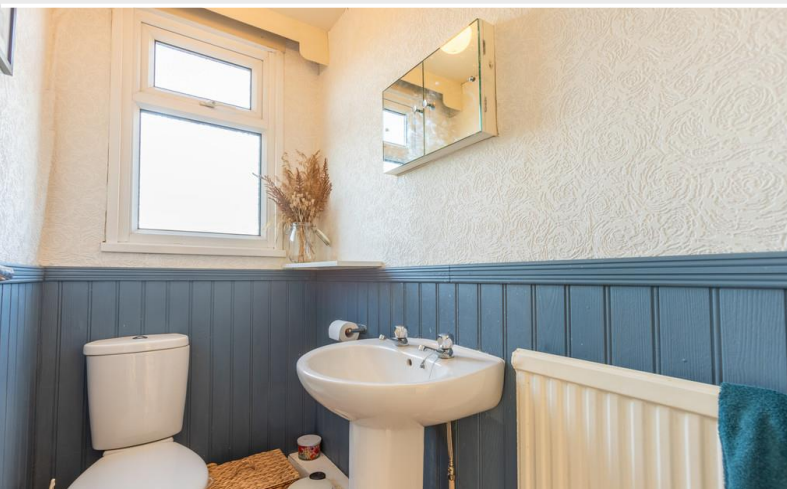
First Floor W.C.