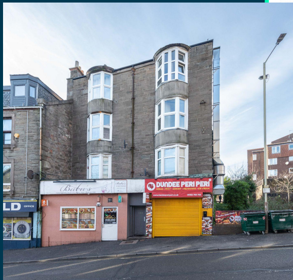
Hilltown, Dundee, DD3