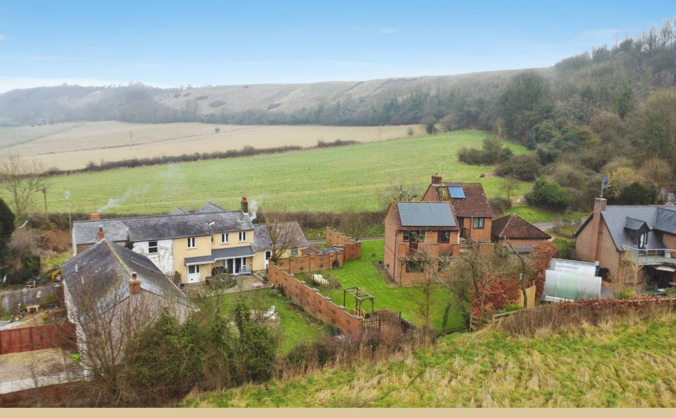
83 Horns Lane, Broad Town £400,000