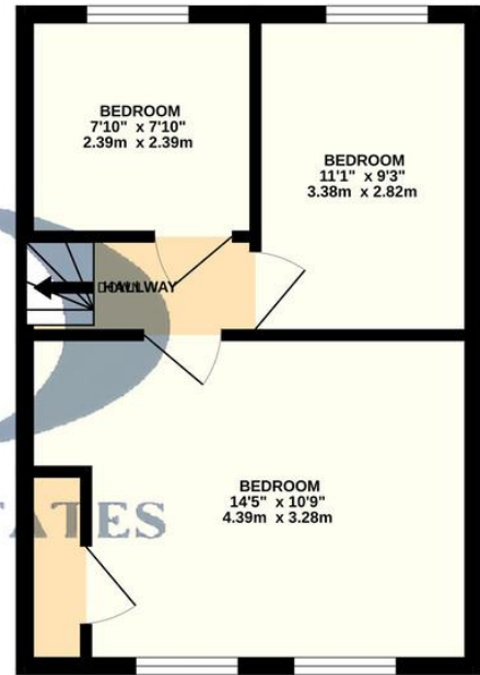
1ST FLOOR 306 sq.ft. (28.5 sq.m.) approx.