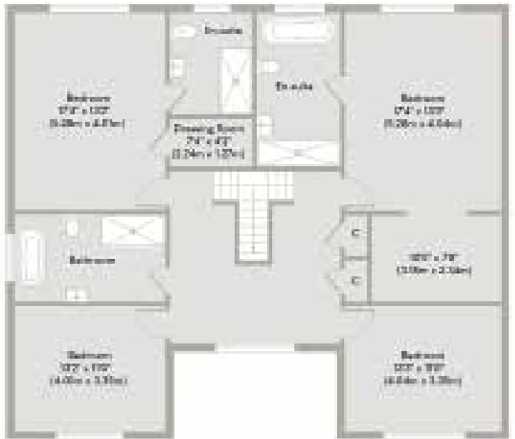
First Floor Approximate Floor Area: 1,415 sq. ft. (131.34 sq. m)