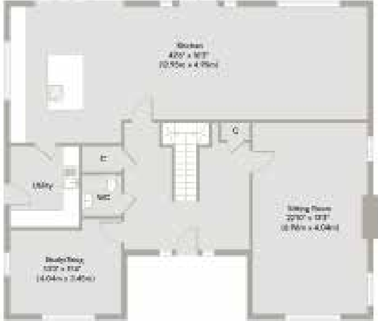
Ground Floor Approximate Floor Area: 1,415 sq. ft. (131.34 sq. m)