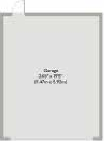
Garage Approximate Floor Area: 528 sq. ft. (48.81 sq. m)