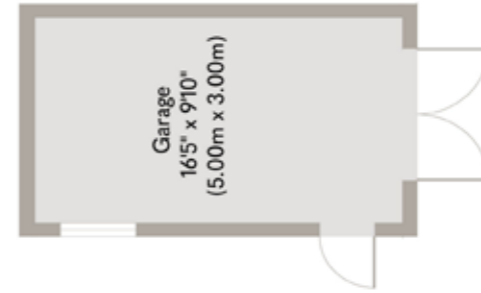
Garage Approximate Floor Area 161 sq. ft (15.00 sq. m)