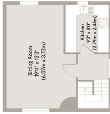
First Floor Approximate Floor Area 370 sq. ft (34.34 sq. m)

Whilst every attempt has been made to ensure the accuracy of the floor plan contained here, measurements of doors, windows, rooms and any other items are approximate and no responsibility is taken for any error, omission, or mis-statement. This plan is for illustrative purposes only and should be used as such by any prospective purchaser or tenant. The services, systems and appliances shown have not been tested and no guarantee as to their operability or efficiency can be given.