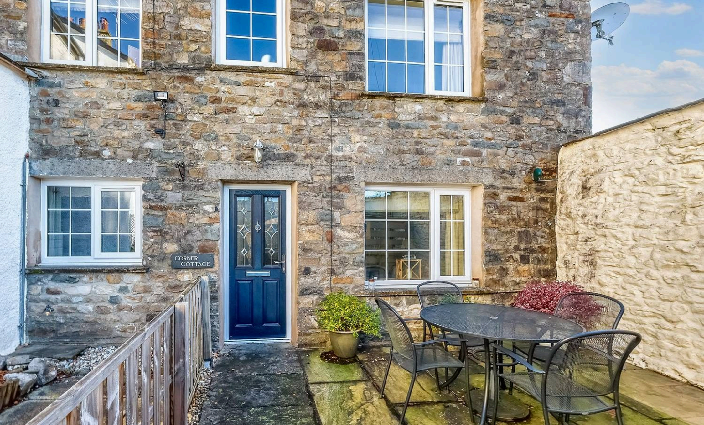
Corner Cottage Davis Yard, Sedbergh £235,000