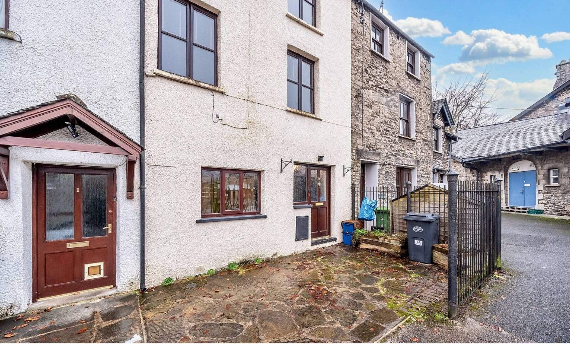
1a Stramongate Hall Cottage, Yard 56 Stramongate £210,000