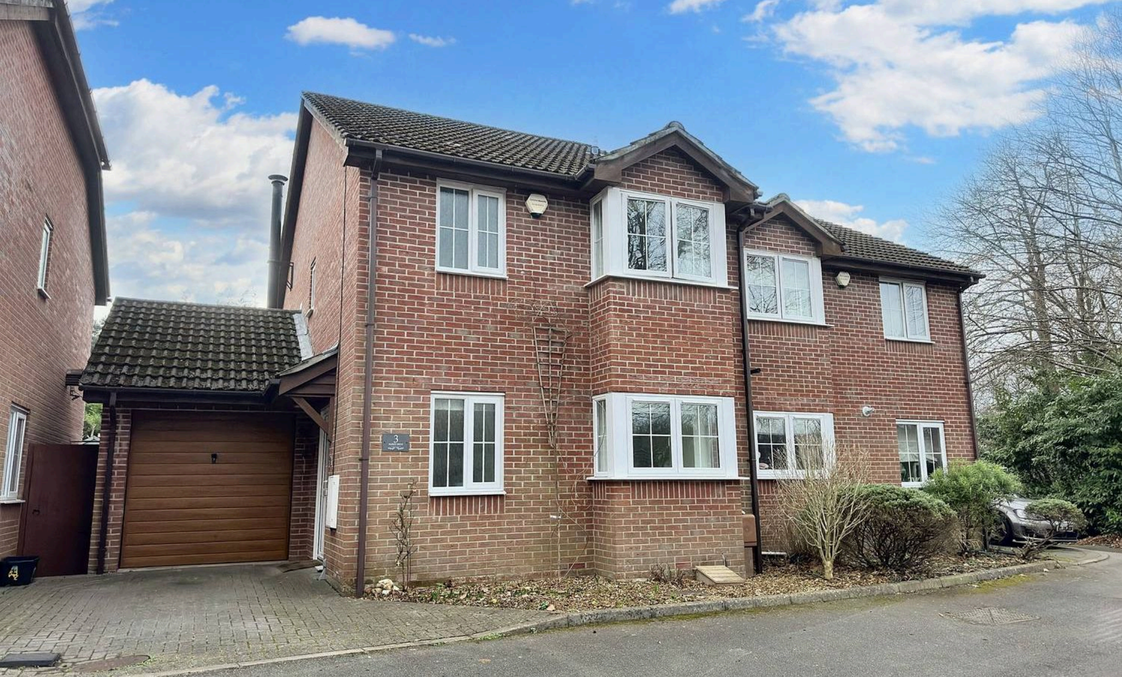
3 Hardy Drive, Hythe £372,000