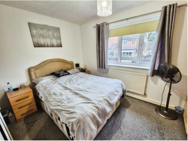
BEDROOM TWO 9' 11" x 9' 10" (3.04m x 3.02m) Rear aspect window, double wardrobe, radiator and carpet.

BEDROOM ONE 9' 11" x 8' 6" (3.04m x 2.61m) Front aspect window, carpet, radiator and double wardrobe.