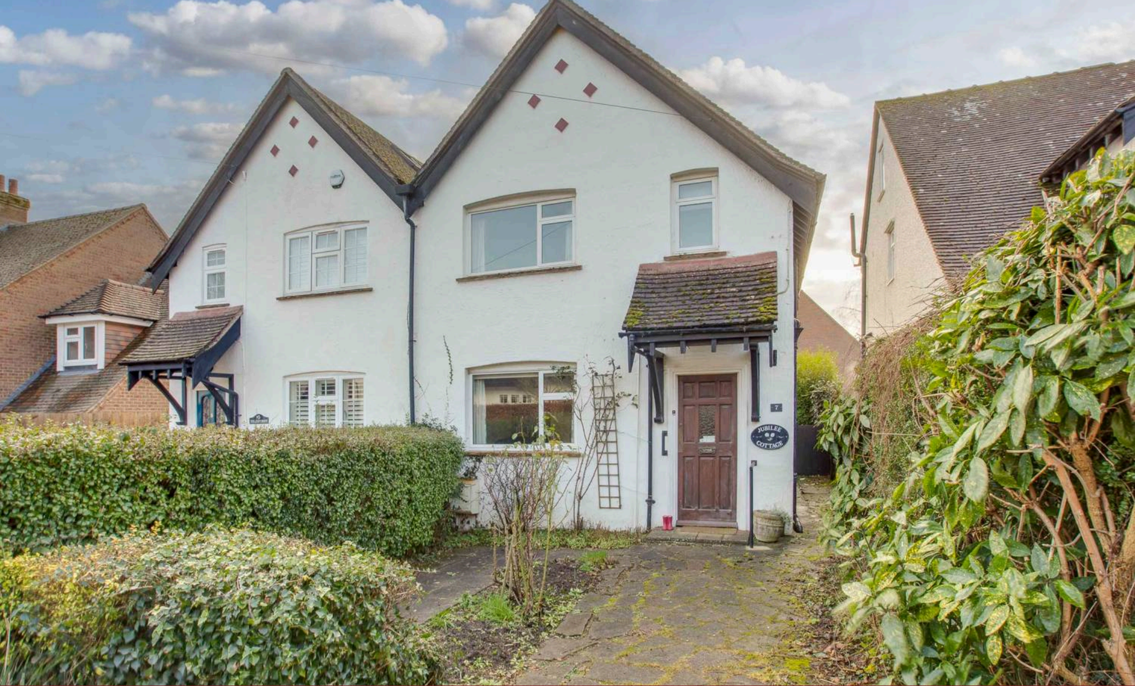
Jubilee Cottage, 7 Twitchell Road, Great Missenden - HP16 0BQ £595,000