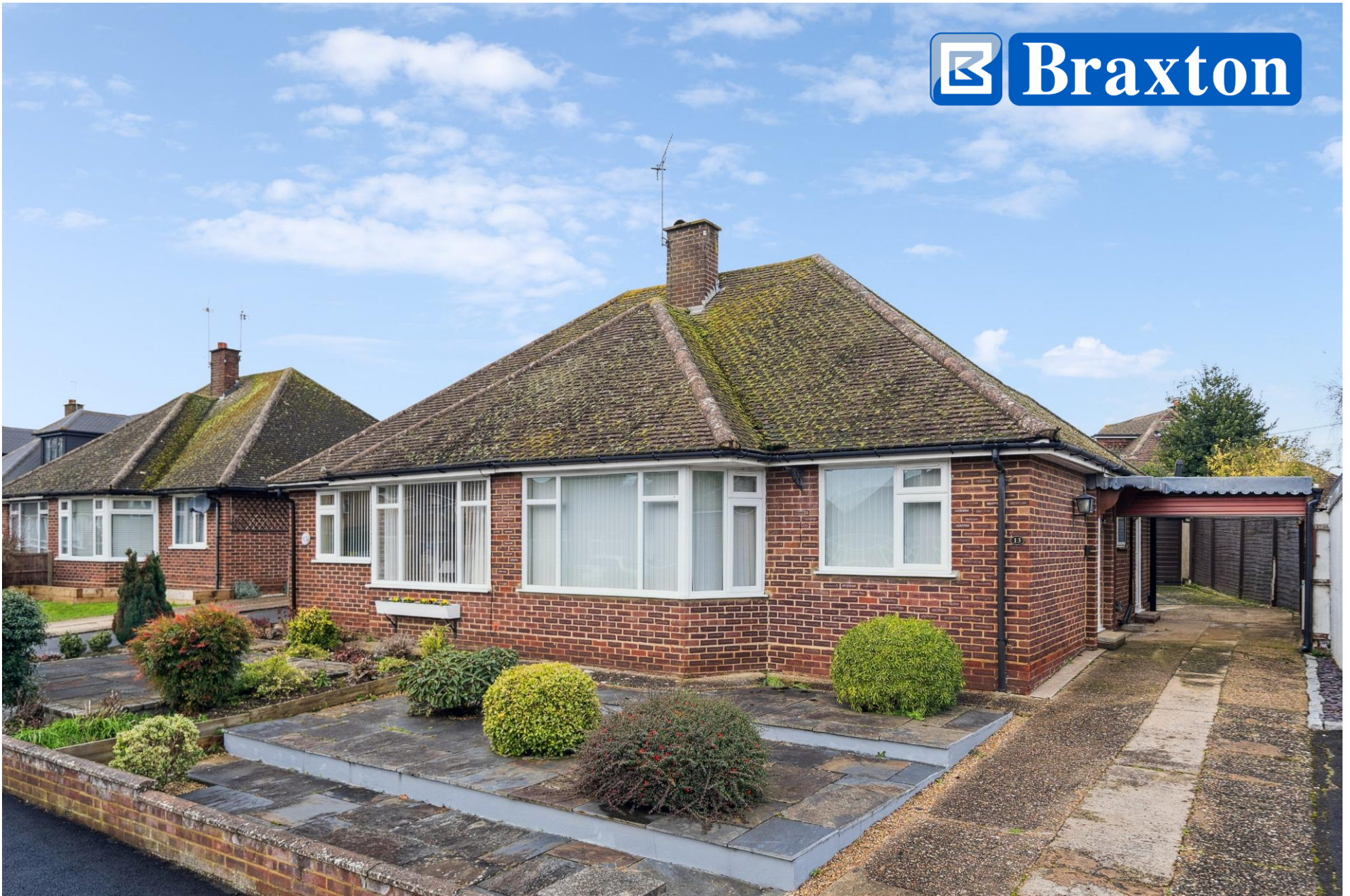
13 KENWOOD CLOSE, MAIDENHEAD, BERKSHIRE, SL6 5AL