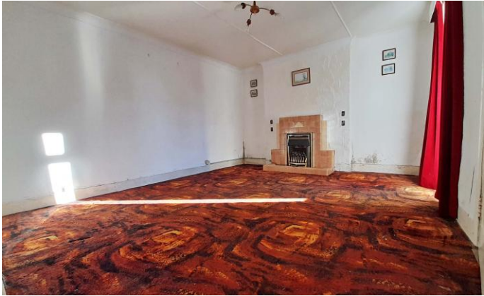
GROUND FLOOR 756 sq.ft. (70.3 sq.m.) approx.

Whilst every care is taken in the preparation of these particulars, their accuracy is not guaranteed and they do not constitute any part of an offer or contract. Any intending purchaser/s must satisfy themselves by inspection or otherwise as to the correctness of these particulars.