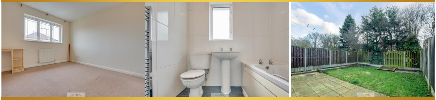
GROUND FLOOR 299 sq.ft. (27.8 sq.m.) approx.