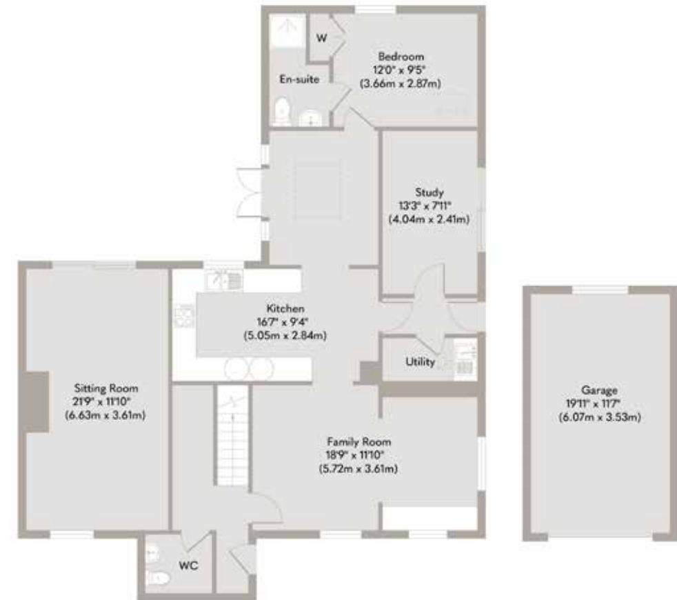
Ground Floor Approximate Floor Area 1,231 sq. ft (114.36 sq. m)