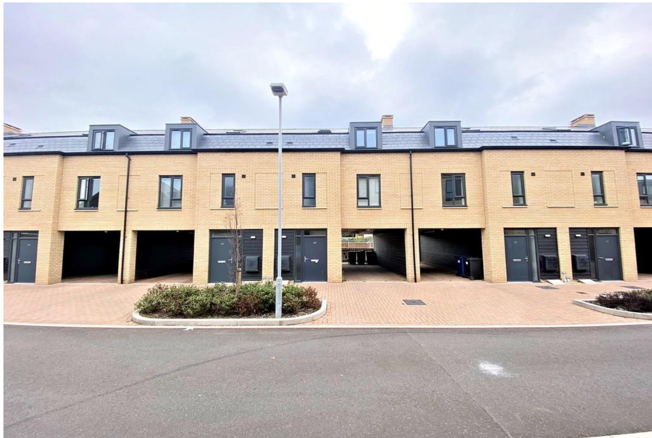
Drovers Place, Huntingdon