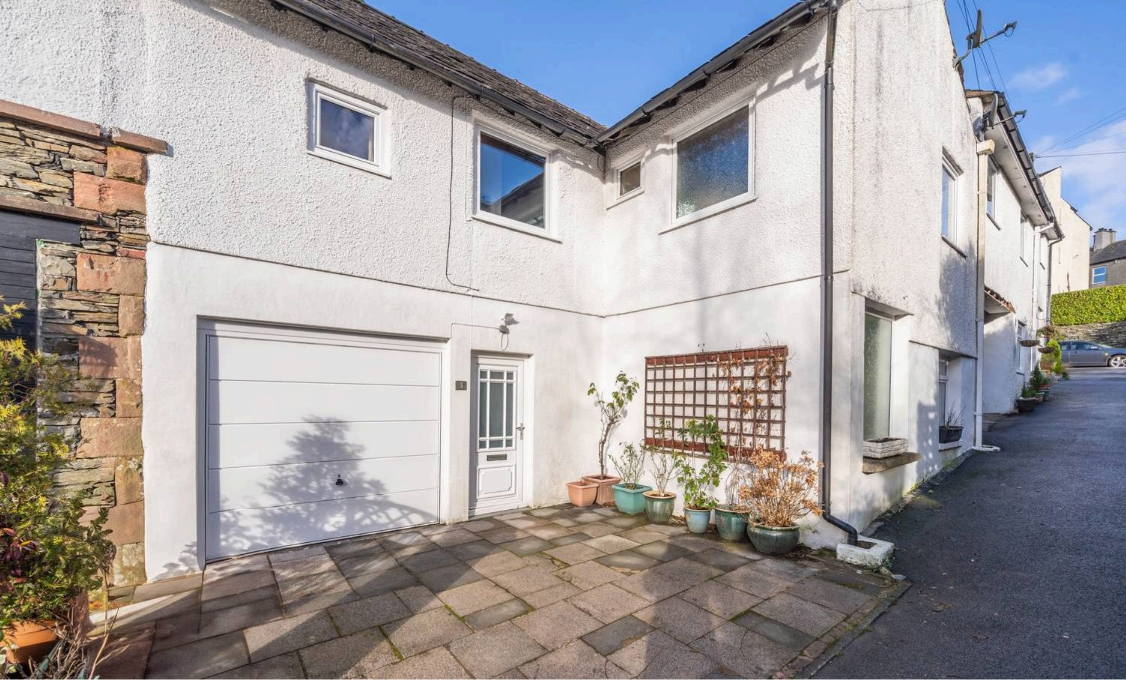
3 Gable Mews College Road, Windermere £350,000