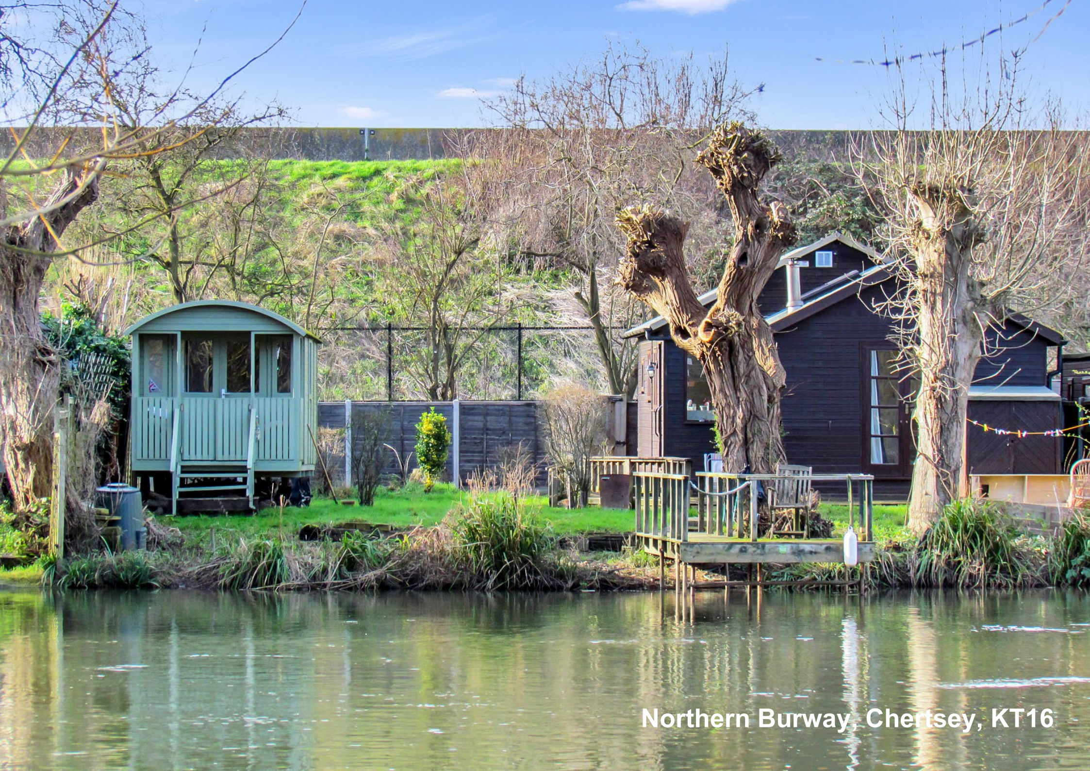
Northern Burway, Chertsey, KT16