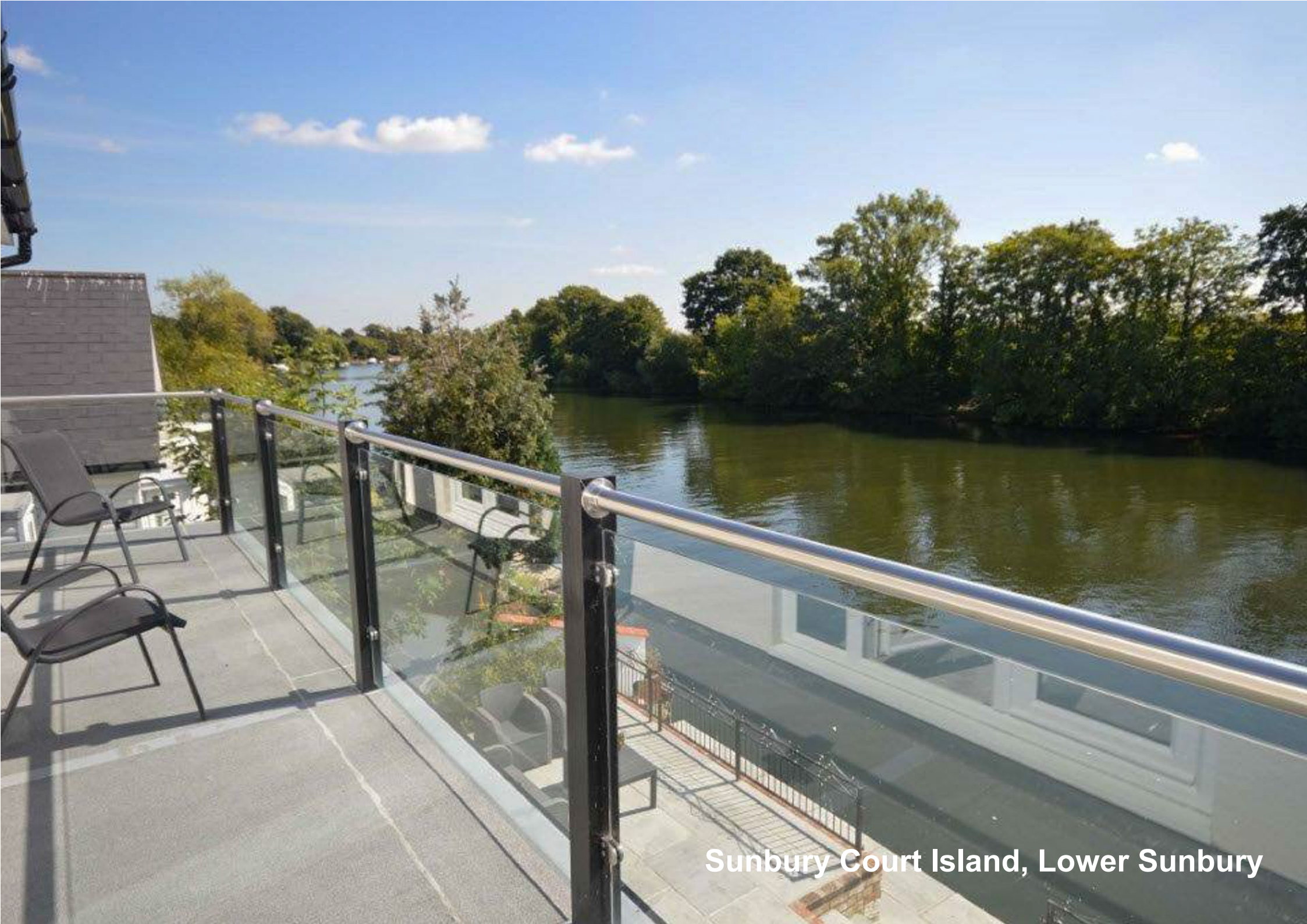
Sunbury Court Island, Lower Sunbury