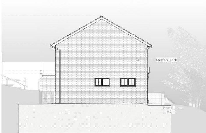
06-Left Side Elevation - Existing