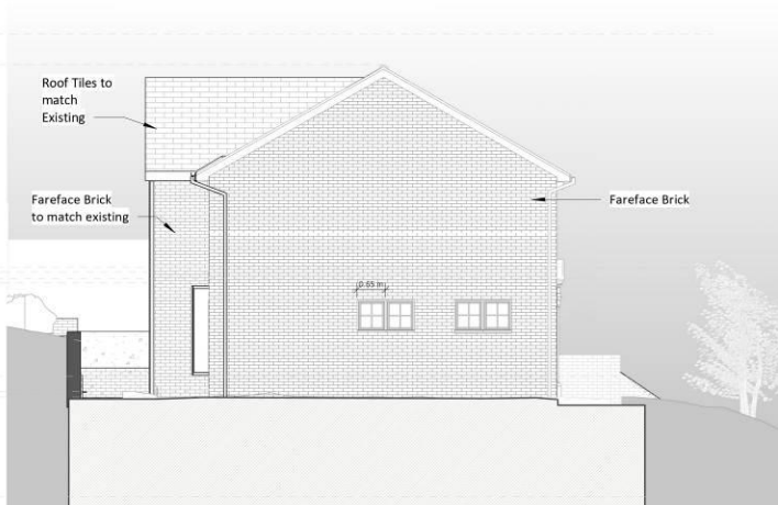
17- Left Side Elevation-Proposed