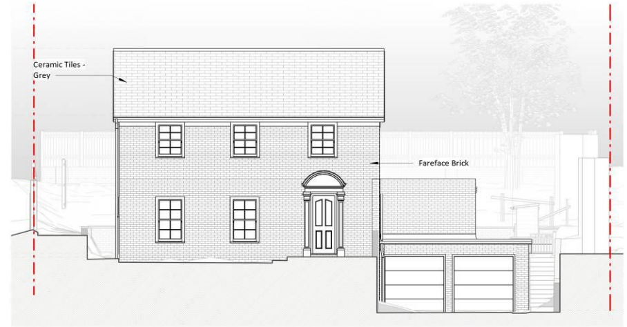
05-Front Elevation - Existing