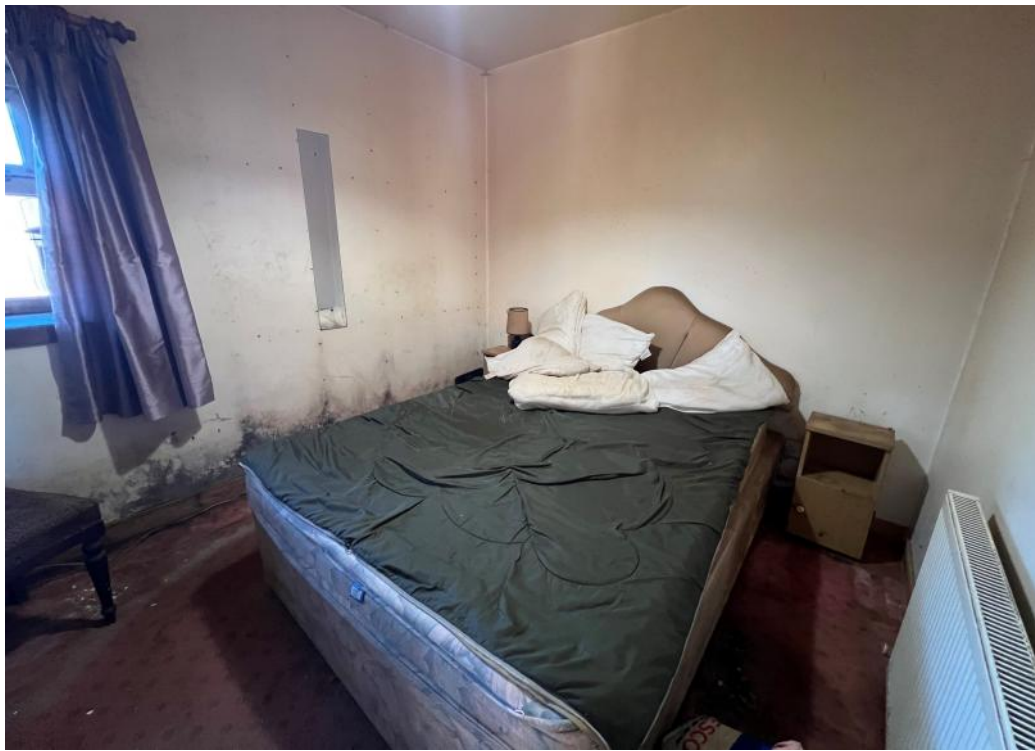
Bedroom & Ensuite