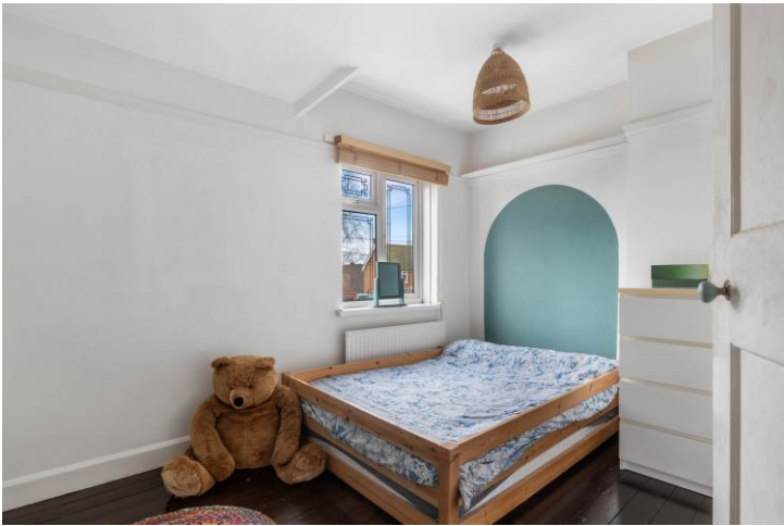
Bedroom Four 3.41m (11'2") x 2.39m (7'10")