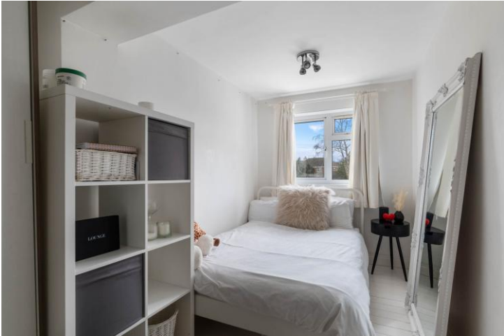
Bedroom Three 3.64m (11'11") x 2.69m (8'10")