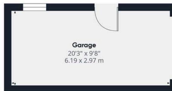
Floor 1 Building 2