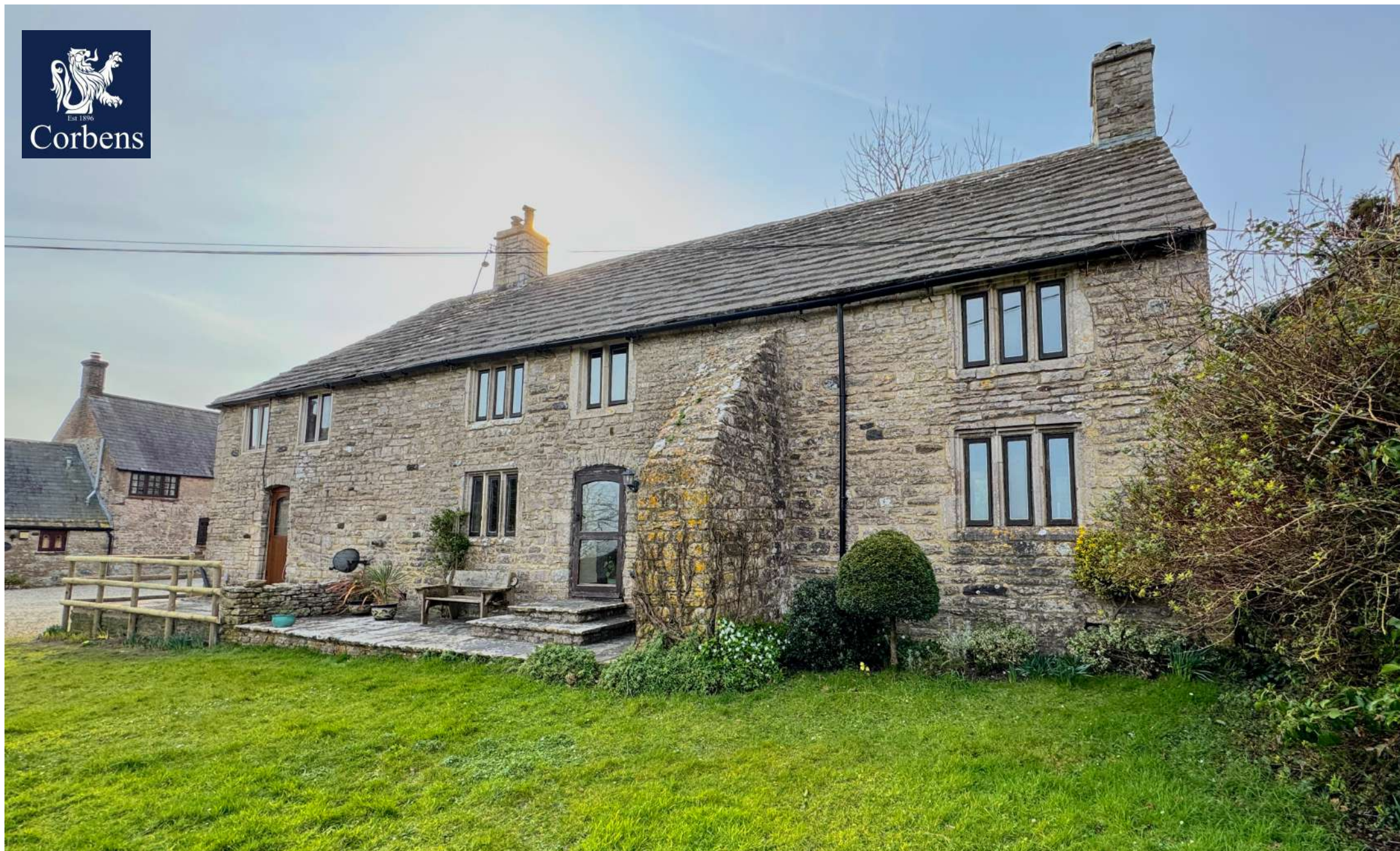
TURRET COTTAGE, WHITEWAY FARM, STEEPLE £595,000 Freehold