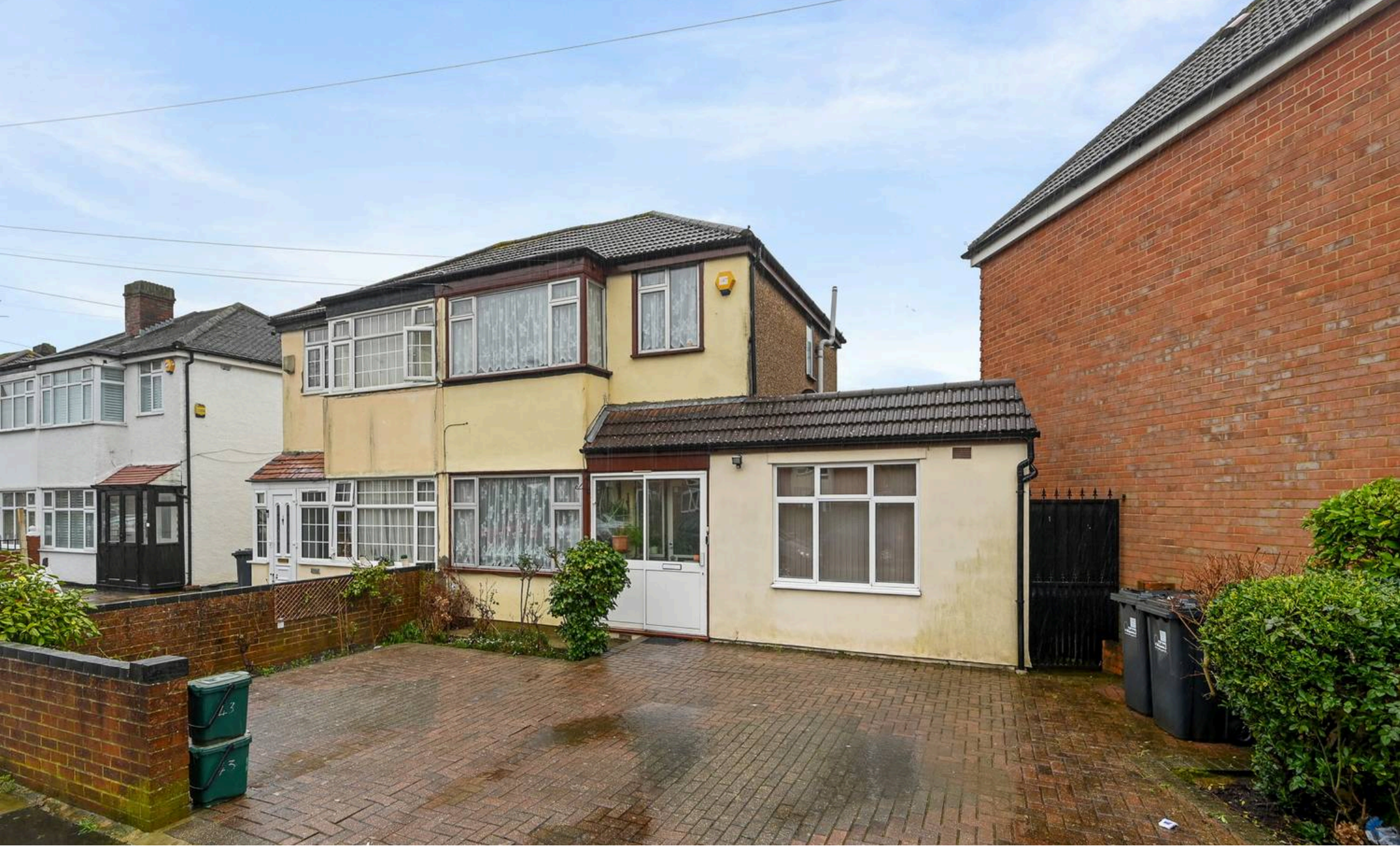
Adrienne Avenue, Southall £599,950