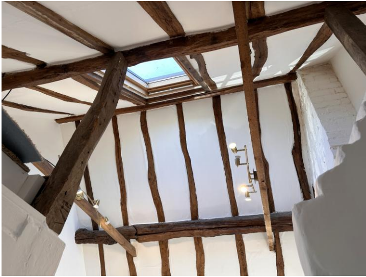
Bathroom 2.05m (6'9") x 1.75m (5'9")