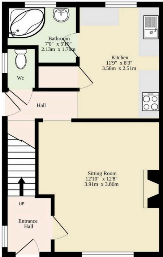
Ground Floor 335 sq.ft. (31.1 sq.m.) approx.