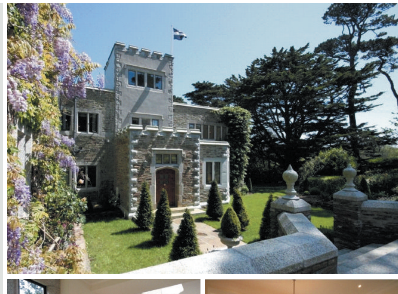
These particulars are intended only as a guide and must not be relied upon as statements of fact. Your attention is drawn to the Important Notice on the last page of the text.

Mawnan 0.5 miles • Helford River 1 mile • Maenporth Beach 1.2 miles • Falmouth 4 miles • Truro 14 miles (London Paddington 4 hours, 18 minutes) • Newquay Airport 32 miles (distances and times approximate)