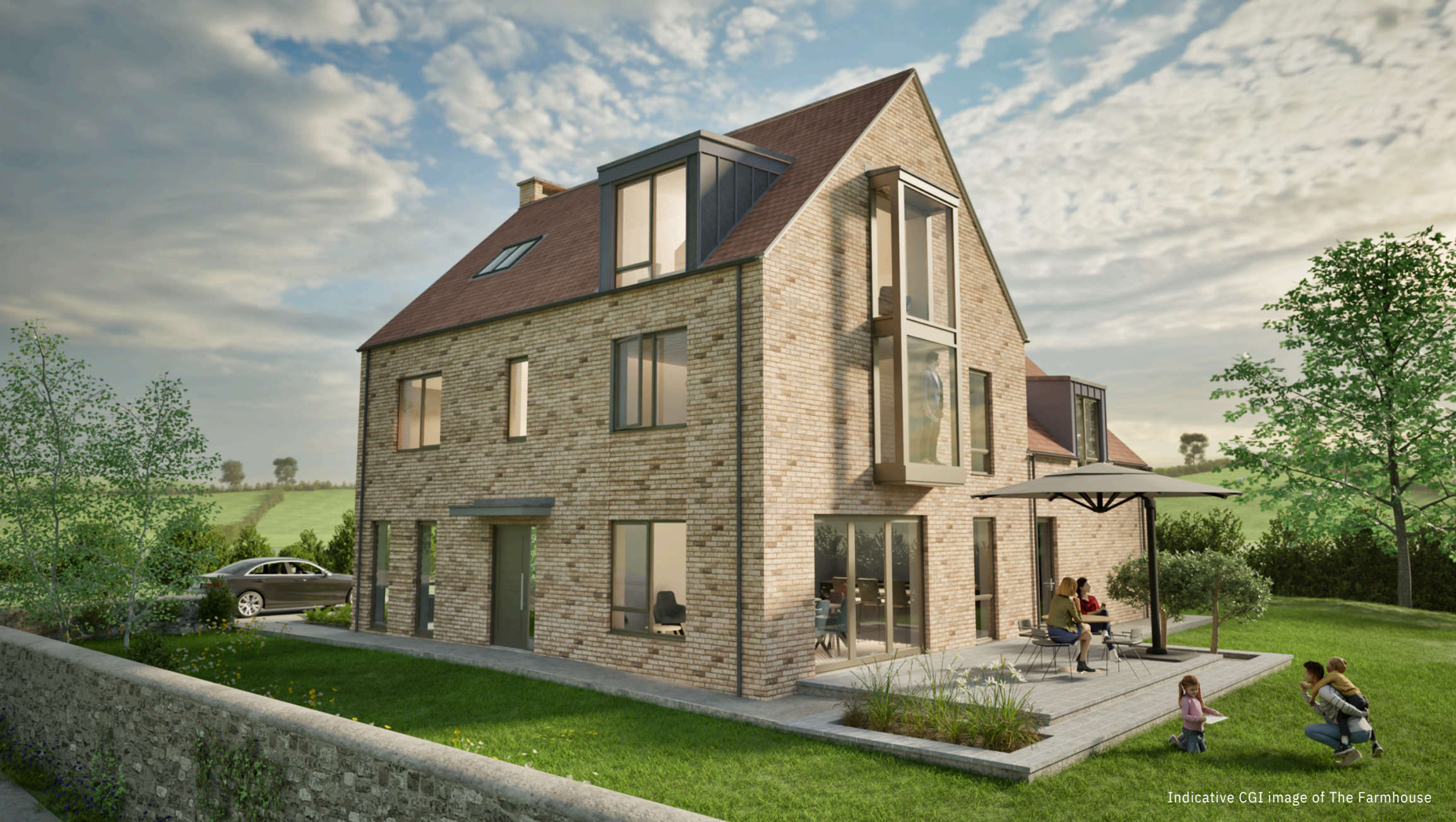
Indicative CGI image of The Farmhouse