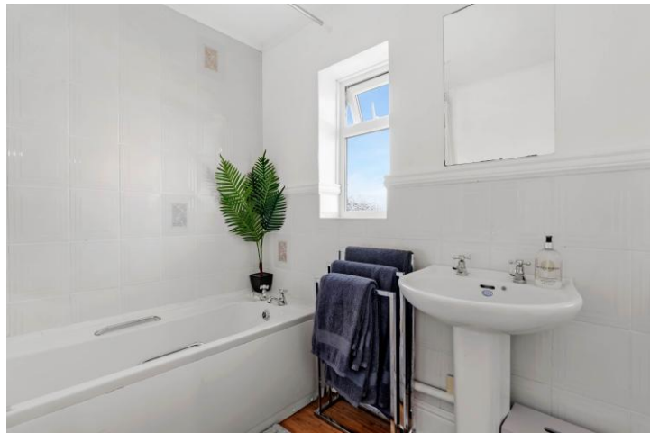
Bathroom 2.90m (9'6") max x 1.77m (5'10")