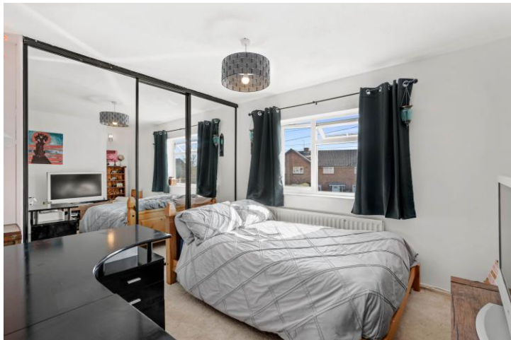
Bedroom One 4.70m (15'5") x 3.53m (11'7")