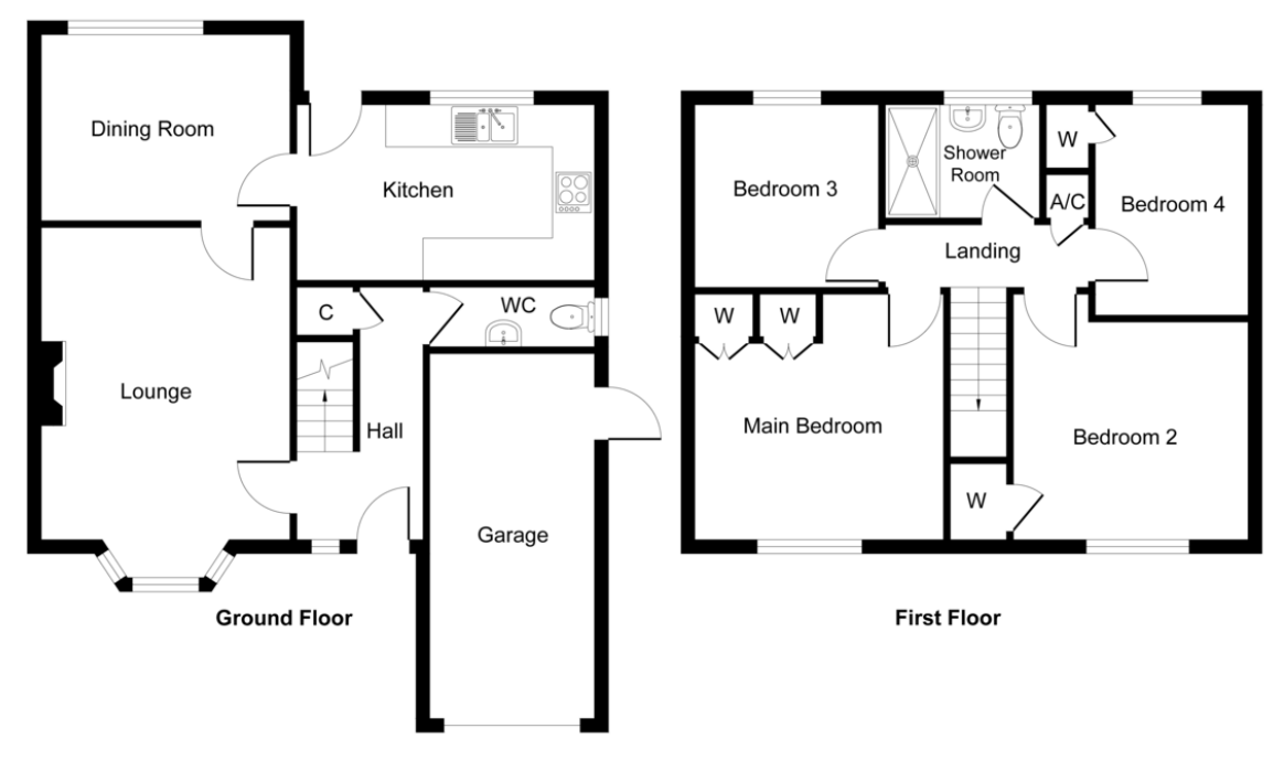
Approx. Gross Internal Floor Area 1,166 sq. ft. (108.29 sq. m)

Whilst every attempt has been made to ensure the accuracy of the floor plan contained here, measurements of doors, windows, rooms and any other items are approximate and no responsibility is taken for any error, omission, or mis-statement. The measurements should not be relied upon for valuation, transaction and/or funding purposes This plan is for illustrative purposes only and should be used as such by any prospective purchaser or tenant. The services, systems and appliances shown have not been tested and no guarantee as to their operability or efficiency can be given. Copyright V350 Ltd 2025 | www.houseviz.com