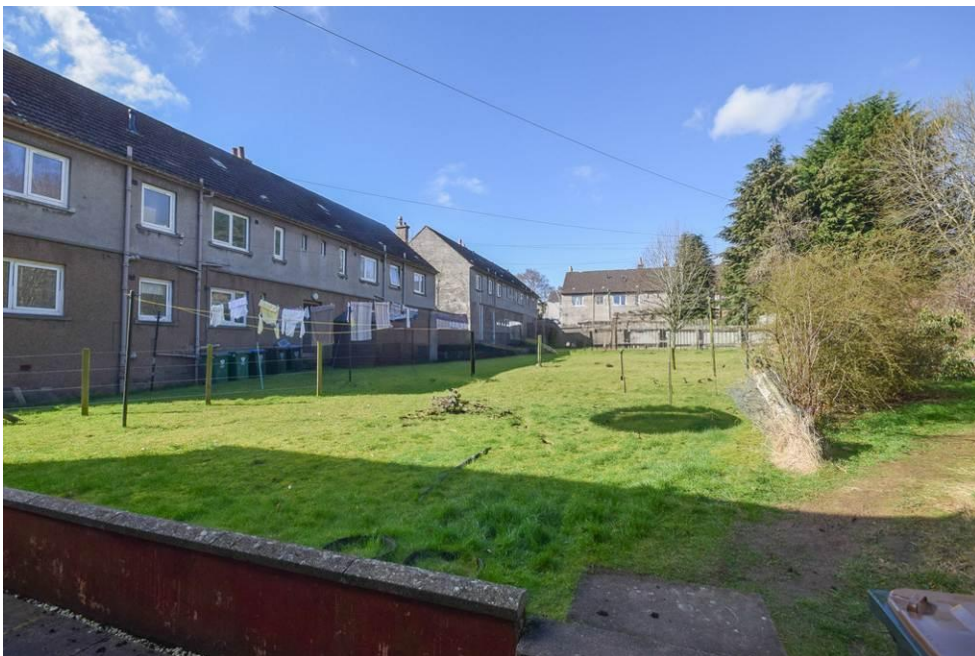
Next Home - 37b Kingswell Terrace, Perth, PH1 2BZ